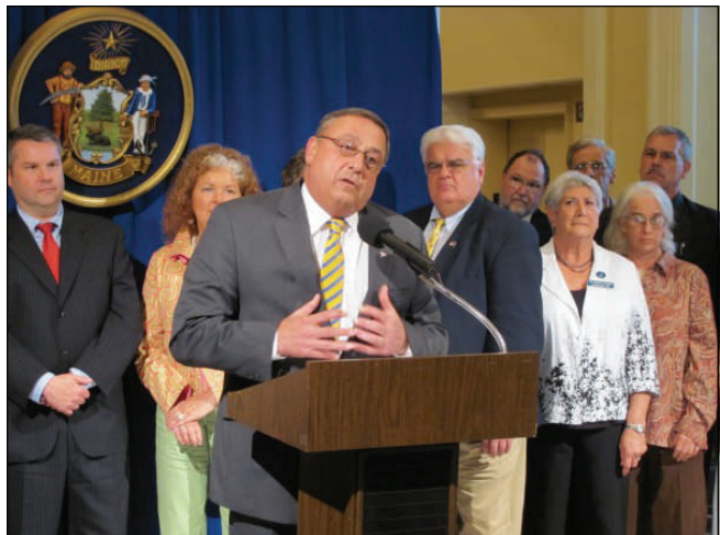
Maine's governor Paul LePage discusses education reforms following his signing of a bill on June 29, 2011 that will allow public charter schools in Maine.

This article was reprinted with the permission of the Bangor Daily News.