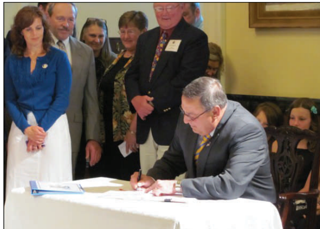
Maine's governor Paul LePage signed a bill on June 29, 2011, that will allow charter schools in Maine. LePage said Maine is now the 41st state with a charter school law on the books.

Charter schools are publicly funded but most often privately run. They often focus on a specific topic such as fine arts or natural sciences and must meet state and federal academic standards. They do, however, have more flexibility in curriculum, budgeting and other issues. The voluntary public schools cannot teach religious practices or discriminate against